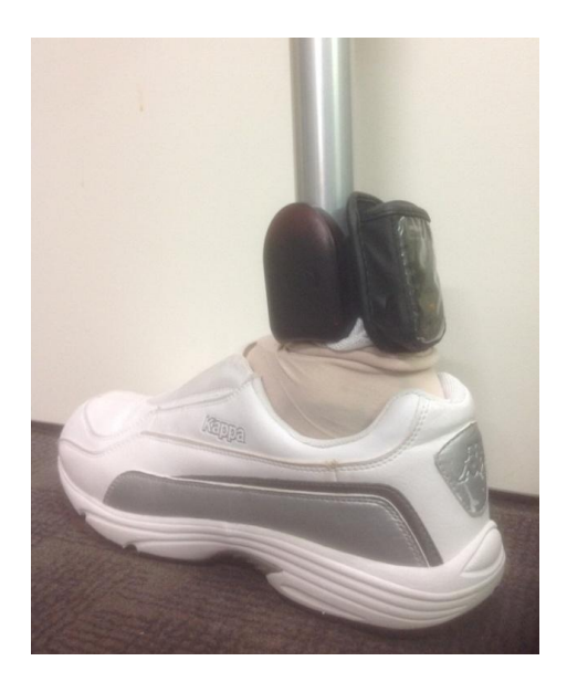
Figure 1. The SAM and GPS devices attached to a prosthesis for data collection. The SAM was positioned according to the manufacturers' recommendations. The GPS was attached to the same strap as the SAM device for convenience.

A QStarz BT-Q1000XT (Qstarz International Co., Ltd., Taipei, Taiwan) 66-channel tracking global positioning system (GPS) travel recorder was used to record latitude, longitude, local date and time of each participant's position for every five seconds of programmed use. The device measures 7.2 \text{ cm} \times 4.7 \text{ cm} \times 2.0 \text{ cm} , has a battery life of 42 h and accuracy error of less than three metres. Data from the GPS unit were imported to QTravel software (version 1.46) and stored within the software database.