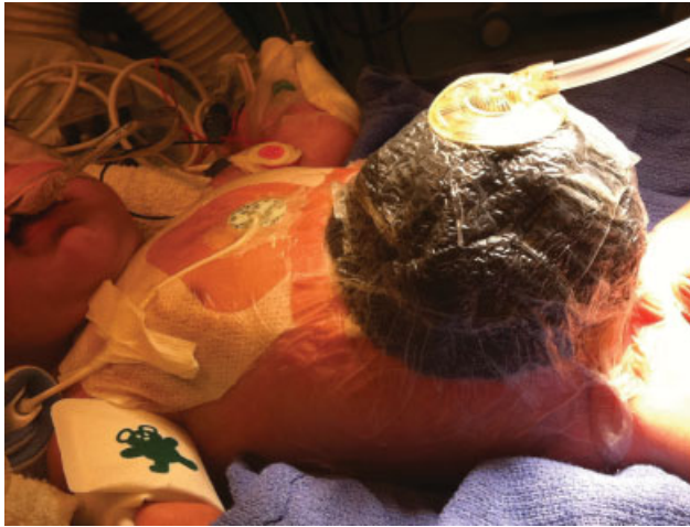
Fig. 1 Initial vacuum-assisted closure dressing on day of life 22.

spring-loaded 5-cm Silicone Silo Bag was placed at birth (Bentec Medical, Woodland, California, United States) and was eventually upsized to a 7.5-cm Silicone Silo Bag. By day of life (DOL) 22, minimal visceral contents had been reduced, and the silo was difficult to maintain due to the large size of the fascial defect and loss of abdominal domain. A bespoke VAC dressing was constructed as follows: Whitefoam and GranuFoam (KCI Medical, San Antonio, Texas, United States) dressings were cut to half their thickness, fashioned in the shape of a cup by sewing strips together, and placed over the eviscerated bowel. Strips of adhesive drapes were used to secure the dressing, circumferentially wrapping the infant. After puncturing the drape, a SensaT.R.A.C. Pad (KCI Medical) was placed over the dressing, connected to a VAC therapy unit, and placed to negative pressure that ranged between 25 and 75 mm Hg (→Fig. 1).