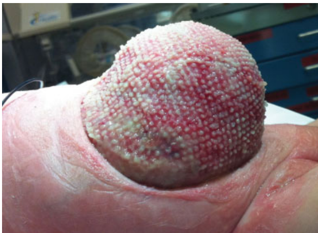
Fig. 2 Gastroschisis on day of life 29, 7 days after vacuum-assisted closure dressing was placed, showing consolidation of herniated abdominal contents.

Endotracheal intubation was necessary for biweekly dressing changes until the viscera were consolidated (→Fig. 2). Then Mepitel (Mölnlycke Health Care, Gothenburg, Sweden) was placed over the viscera prior to Whitefoam and GranuFoam dressings (→Fig. 3). By DOL 50, the abdominal contents