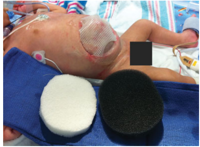
Fig. 3 Gastroschisis on day of life 39, 17 days after vacuum-assisted closure dressing was placed, showing dressing materials and nearly complete reduction of herniated abdominal contents.

were completely reduced, and VAC therapy was discontinued. Mepitel was placed until the wound was closed (→Fig. 4).