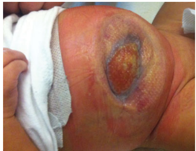
Fig. 4 Gastroschisis on day of life 78, showing wound contraction.

Gastroschisis closure has challenged pediatric surgeons for decades. Standard of care for many years entailed immediate primary closure at birth, which resulted in respiratory compromise, abdominal compartment syndrome, bowel ischemia, decreased lower extremity perfusion, anuria, and need for vigorous fluid resuscitation to maintain blood pressure. 6 Occasionally, in challenging cases, silicone sheeting or other plastic