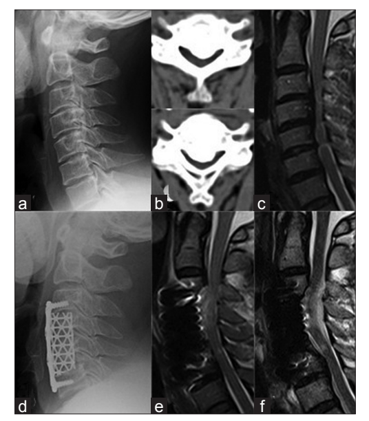
Figure 2A: A 45-year-old man, who also suffered from continuous cervical OPLL of multiple levels. (a–c) Preoperative lateral X-ray, cervical plain CT and MRI demonstrated significant compression of the spinal cord. The patient underwent subtotal C4–C6 corpectomy and decompression, and a titanium mesh cage and plate combined with bone graft was used for the fixation. (d) Postoperative lateral X-ray showing satisfactory reduction with a titanium mesh cage and plate, (e, f) but the degeneration of the spinal cord can be observed at the day after surgery and 24 months postoperative, respectively