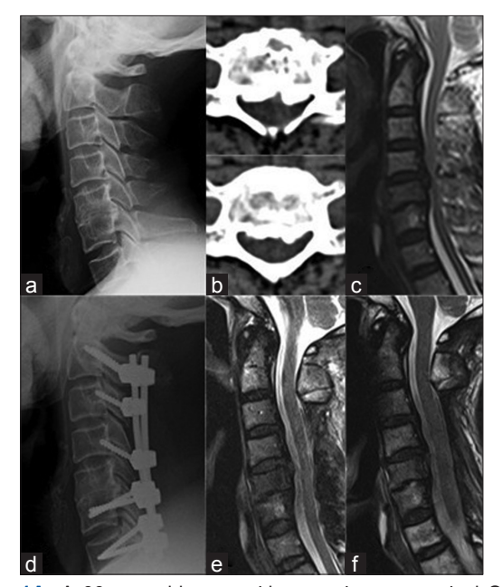
Figure 1A: A 66-year-old man, with a continuous cervical OPLL involving multiple levels. (a–c) Preoperative lateral X-ray, cervical plain CT and MRI demonstrated significant compression of the spinal cord. The patient underwent C3–C6 laminectomy, decompression and pedicle screw fixation. (d) Postoperative lateral X-ray showing satisfactory fixation with a pedicle screw system. (e, f) Plain MRI on the day after surgery and 24 months postoperative demonstrated good morphology of the spinal cord

time of initial onset of C5 palsy symptoms were all within 8 hours postoperative. The patients were treated conservatively by oral neurotrophic drugs, hyperbaric oxygen therapy and exercise. Three months later, one patient's symptoms disappeared. Symptoms of the other patient were relieved, and the patient was considered as having poor outcome. One patient experienced progression of the OPLL and had deterioration of nervous function after 45 months, which was successfully managed by anterior decompression and fixation, and was also considered as having poor outcome. No case of implant failure was observed.