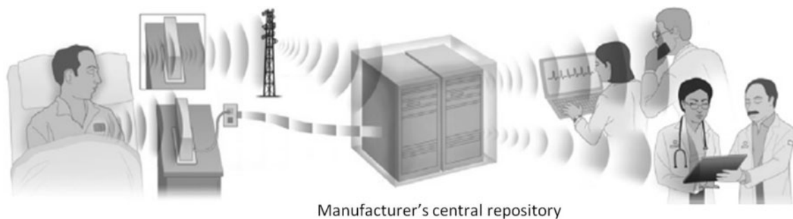
Figure 1 Illustration of the wireless remote monitoring technology for cardiovascular implantable electronic devices. The data transceiver is typically situated in the patient's bedroom, to receive data from the implant automatically during the night and relay them to the manufacturer's central repository using a mobile network link or a landline. Caregivers will receive automated e-mail, SMS, or fax alert notifications if pre-specified criteria are met and can view all transmitted data on a secure, dedicated website.

In contrast to RCTs, non-randomized studies with mega cohorts of (>100 000) patients treated with ICDs or CRT-Ds, 35,47,48 or medium cohorts (~1000 patients), 49 have shown 45–50% reduction in mortality in the RM arm over up to 5 years of follow-up ( P=0.002 to P<0.0001 , using weekly or less frequent data transmission). The survival improvement was amplified with higher levels of RM utilization, indicating a 'dose-dependent' effect. 15,35 According to their non-randomized fashion, there are possible sources of bias in these