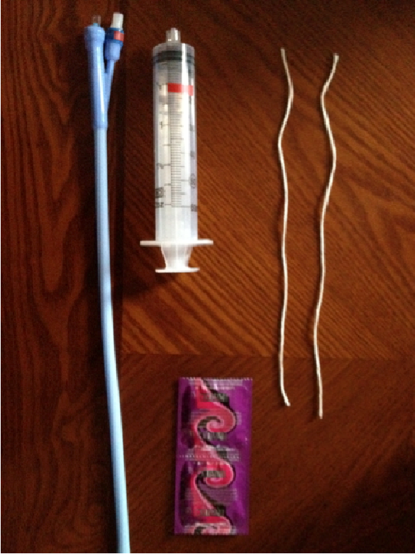
Figure 2: The balloon device include a catheter, a condom and a 60 ml syringe