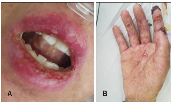
Fig. 4. The stomatitis (A) and skin eruption (B) entered clinical remission after rituximab treatment.

mucosal involvement, PNP is frequently misdiagnosed as Stevens-Johnson syndrome/toxic epidermal necrolysis (SJS/TEN). Although the prevalence of SJS/TEN-like PNP is lower than that of SJS/TEN, its mortality is much higher 4 . In some cases, PNP is diagnosed before the detection of an underlying malignancy, so early diagnostic work-up of the underlying neoplasm is necessary for treatment. Therefore, the differential diagnosis of SJS and SJS/TEN-like PNP is important, and PNP should be considered in patients with an atypical clinical course of SJS/TEN.