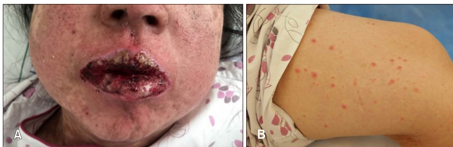
Fig. 1. Clinical images taken on the initial visit. Painful stomatitis (A) and a maculopapular eruption covering the whole body (B).

tival injection accompanied by fever, diarrhea, and weight loss (Fig. 1). The maculopapular eruption rapidly progressed to ulcerative patches, especially on her palms. She denied any medication history. Leukocytosis and eosinophilia were noted, but all other laboratory tests were within the normal ranges. Stevens-Johnson syndrome (SJS) with mucosal involvement was suspected, so she admitted to the internal medicine department for systemic steroid treatment.