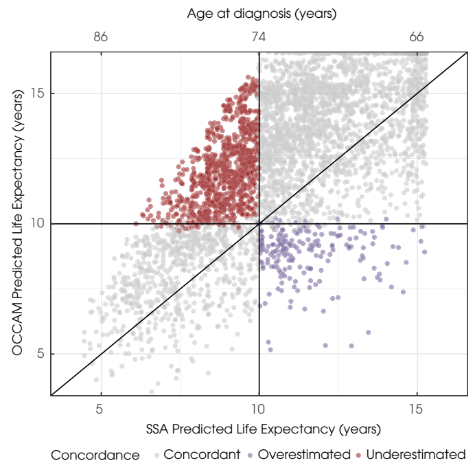
Fig. 3 Scatterplot comparing Social Security Administration's 2001 actuarial life table predictions (SSA) and patient age to predictions from our other-cause comorbidity-adjusted model (OCCAM) in a cohort of 8220 men with prostate cancer from the Prostate, Lung, Colorectal, and Ovarian Cancer Screening Trial (PLCO). Concordance is defined here as whether or not it would alter treatment according to National Comprehensive Cancer Network guidelines, which makes treatment determinations based on whether or not life expectancy is greater or less than 10 years, marked here by horizontal and vertical lines. The diagonal line indicates perfect agreement.

recommendations in approximately 15% of the men in PLCO. Twelve percent of men in PLCO would have their NCCN-recommended treatment altered by an over-pessimistic prediction from SSA, while 2.4% of men in PLCO would have their treatment altered by an over-optimistic prediction from SSA.