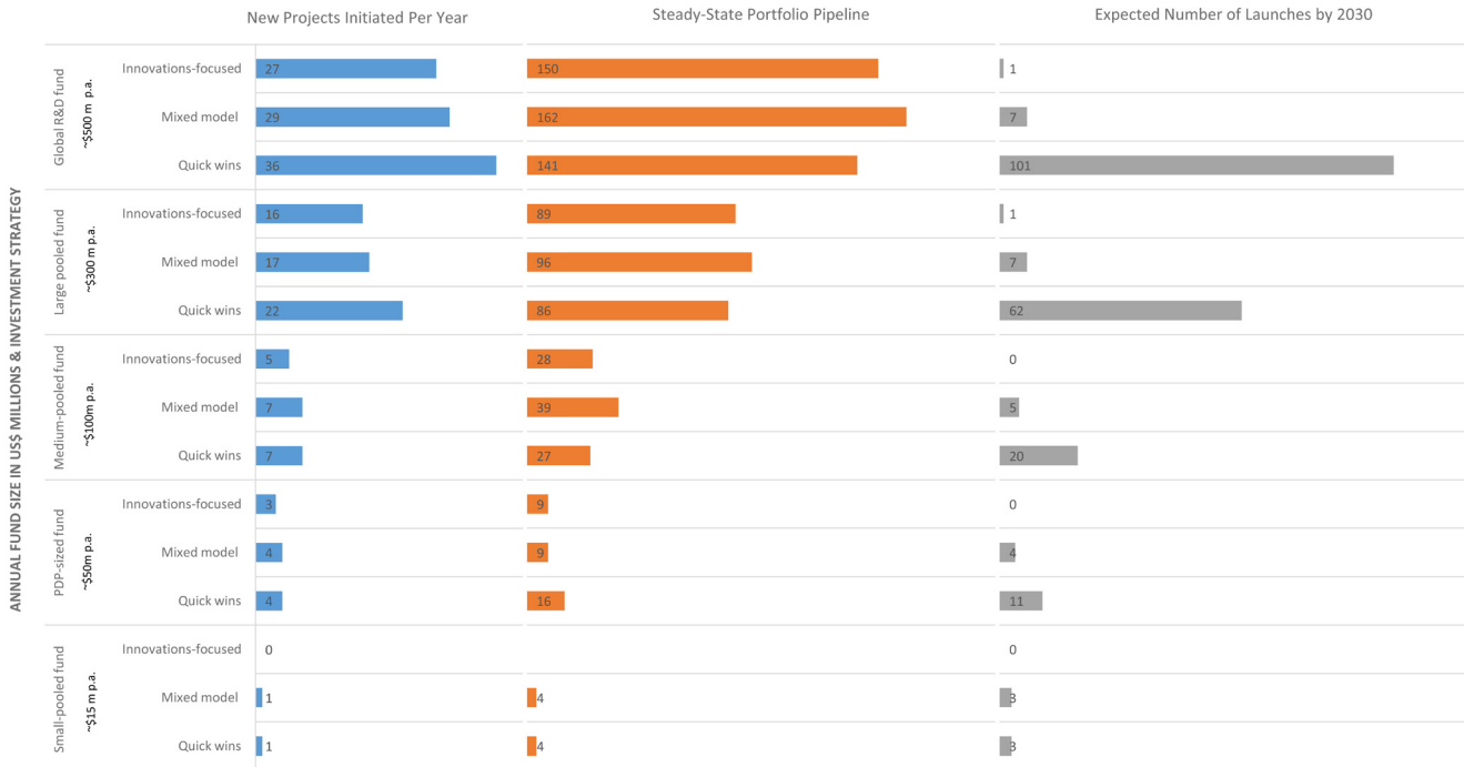
Figure 3. Spectrum of financial mechanisms explored.