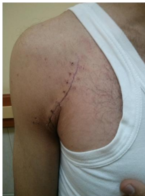
Figure 2: Two weeks after surgery 35 years old patient

depending from the bone structure and pattern of coracoids process. The osteotomy can be made with an oscillating saw or with a good slightly curved 15 mm osteotome. We have used both with excellent cut and with no complication from fractured coracoids process.