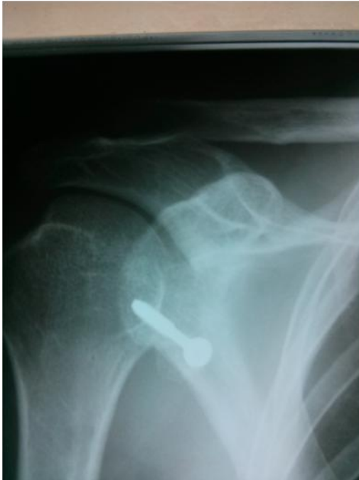
Figure 4: Ideal placement for titanium screw just below the equator line

We prefer to put the graft in “standing” position and fixing with one screw, providing a good denudated scapular surface and cancellous coracoid. We have seen no fibrous union and no bone fracture. The only difficult momentum may be the possible rotation of the coracoid piece, which can be eliminated by a stand grasping in the last phase. With the arm in external rotation, the tendon of the subscapularis was horizontally split (Fig. 3).