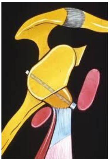
Figure 1: Coracoid transfer anterior to glenoid rim fixed with a single screw

We intend to evaluate the functional and clinical outcome of the Bristow-Latarjet procedure in patients with glenohumeral instability treated surgically.