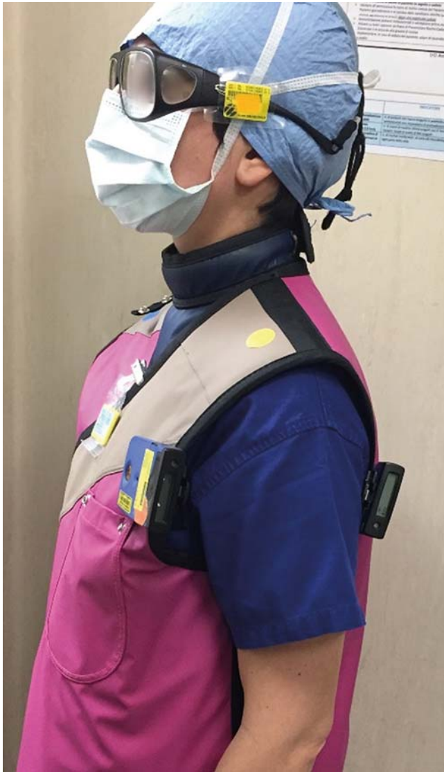
► Fig. 1 The two dosimeters were placed with one outside the lead apron at the left upper chest position of the endoscopist, and the other at the back, specular to the first.

Student's t tests, with statistical results considered significant at P values less than 0.05.