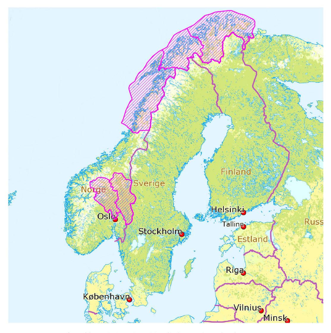
Fig. 1. Adolescents in six counties participated in the Norwegian Youth Study 2001–2004.

We used a Geographical Information System (GIS) to determine the percentage of green areas around schools. First, all the schools were geocoded. Next, we produced buffers with radii of 1000 m and 5000 m around each school, and then we computed the amount of green areas within each buffer (Fig. 2). Green area was retrieved from land cover maps downloaded from the Norwegian Mapping Authority's website. We selected the following attributes to represent green areas: park, forest, open area, sports arena, alpine hill, cropland, river and stream, fresh water dry fall, golf course, graveyard, ocean surface, lake, and marsh. We also produced green area variables without the "open area" attribute. The green area variable was included in the analyses as both continuous and categorical variables. For the latter, we divided the variables into five categories (quintiles), representing five degrees