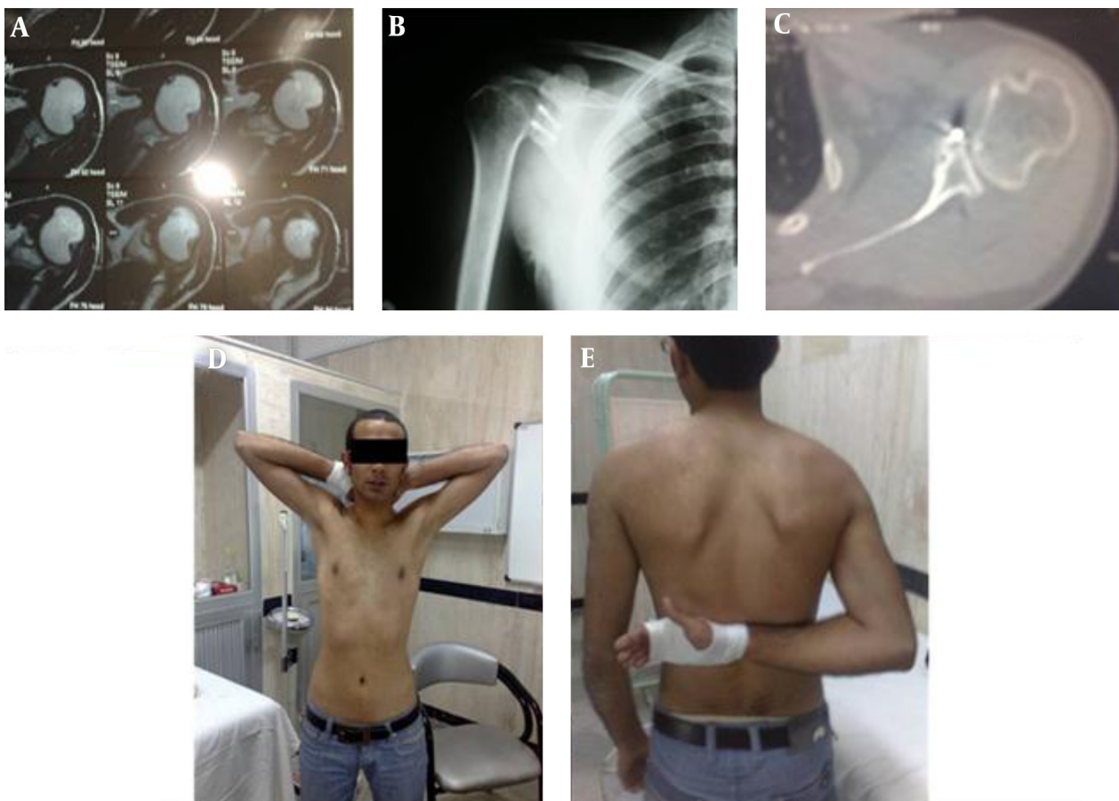
A) Bony Bankart lesion and a Hill Sachs lesion on humeral head; B) Post-Operative X-ray; C) Follow-up CT scan shows solid union of the coracoid graft; D) Normal external and internal rotation ranges of motion of the shoulder one year after surgery compared to unaffected side; E) Internal rotation range of motion of the shoulder one year after surgery

ligament were detached and the bone was used as a bony block in the anterior inferior glenoid region between su-