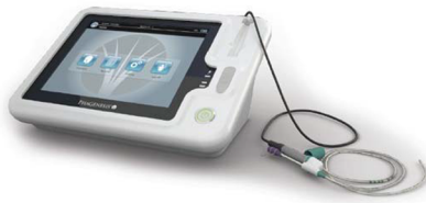
Figure 3 The Phagenyx® system.