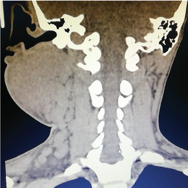
Figure 2. CT neck showed ill-defined large heterogenous enhancing soft tissue mass at right parotid mass measuring 7.6 cm x 5.0 cm x 8.7 cm, with multiple enlarged right cervical LN.

cm x 8.7 cm, involving the right parotid gland and also the presence of multiple enlarged right cervical LNs from levels I to V (Figure 2).