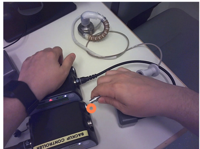
Fig. 2 Gaze point of patient during controller change task

serve as “novice” control group, while additional three experts (VAD-technicians or perfusionists) formed an expert control group. Patients had to be \geq 18 years old, able to consent and speak German (B2). Twelve patients (including two pre-operative patients) had to be excluded from the analysis: three were deficient in reading German, one performed an early start of the controller change, for two patients the study had to be aborted due to an adverse emotional reaction to the controllers' alarm, technical difficulties arose with three patients and three patients failed to successfully perform the controller change task. The characteristics of participants are shown in Table 1. The patients were stratified based on the duration of LVAD support. The cut-off was defined for the duration of LVAD support of \geq 1 year based on the impact of LVAD implantation on patients' cognitive function [23].