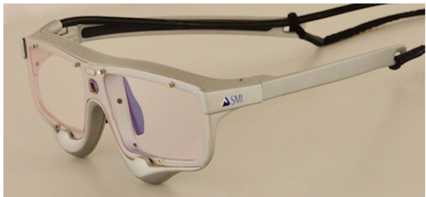
Fig. 1 SMI ETG 2 Wireless mobile eye tracking glasses (Senso Motoric Instruments, Teltow, Germany)

Out of the 240 patients currently supported by HVAD systems at this institution (out of a total of 350 long-term LVAD patients), 44 patients were enrolled in the study after informed consent and 32 patients were included in the analysis. Eight patients (six for analysis) were pre-operative patients, that