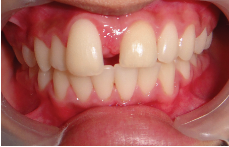
FIGURE 1: Spacing between 11 and 21 with extrusion and slight labial displacement of 11.