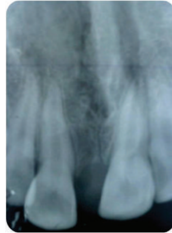
FIGURE 3: Rarefaction of bone on the mesial aspect of the cervical and middle third of the root of 11.

a nodule of tissue in between, which the patient pinched out 1 year back (Figures 1, 2(a), and 2(b)). He gave a history of trauma to the anterior teeth 8 months back. On intraoral examination, full complement of permanent teeth except the third molars was present. A midline diastema of 0.5 cm was present between 11 and 21 with slight labial displacement and extrusion of 11. There was a well-defined swelling of 2 \times 2 cm size on the palatal aspect of 11, 12 involving the marginal and attached gingiva that extended into the midline area. It was pale pink in color with an intact epithelium and a nodular surface. It was nontender, soft in consistency, nonfluctuant, compressible, and nonindurated. Radiographic examination showed spacing between 11 and 21 with the alveolar crest at the cemento-enamel junction, rarefaction of bone on the mesial aspect of the cervical and middle third of the root of 11, and