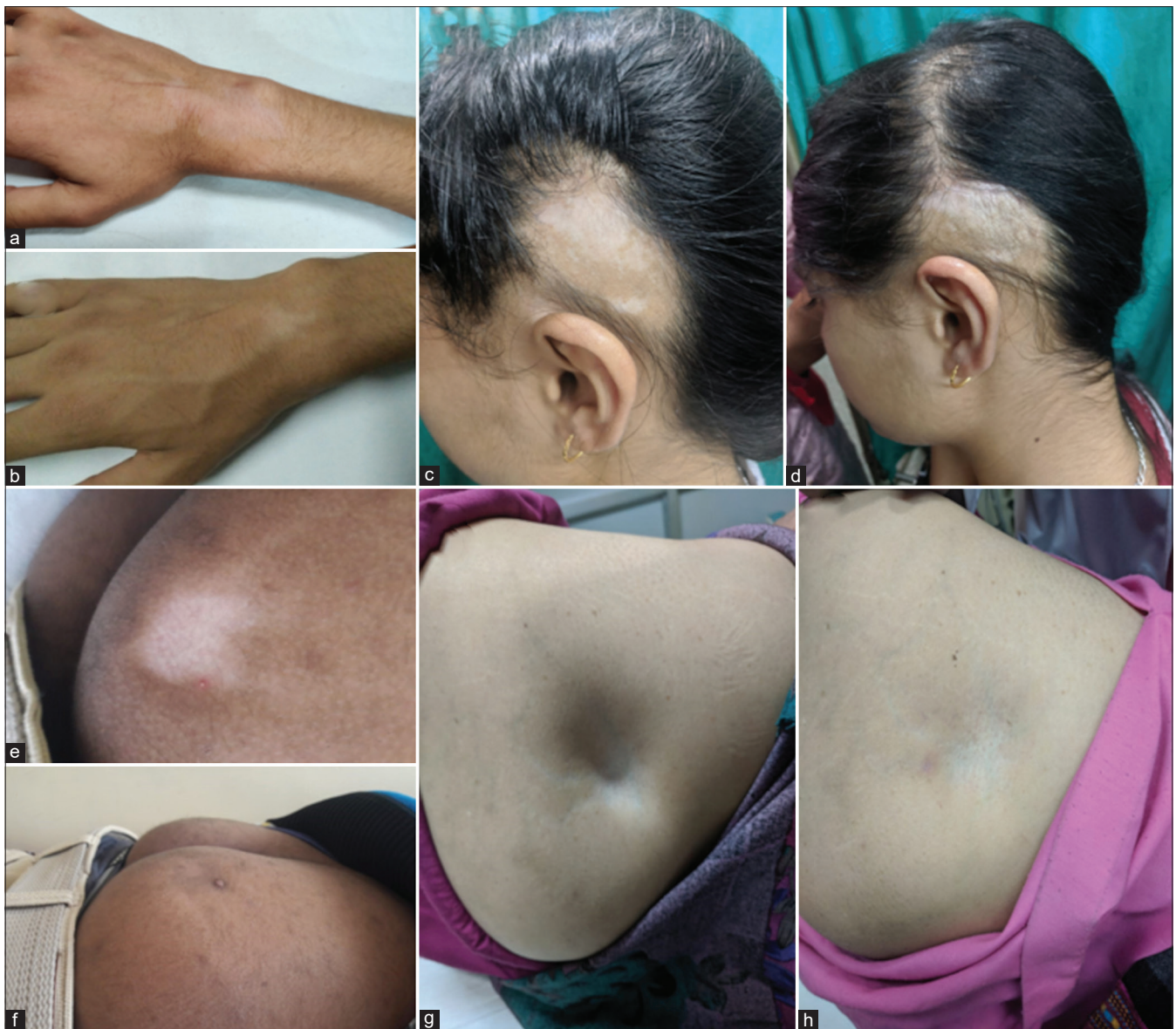
Figure 1: (a) Depigmentation without evident atrophy over the wrist (b) Decrease in pigmentation after 4 weeks of tacrolimus (c) Depigmentation and atrophy in alopecia areata patch after triamcinolone (d) Hair regrowth after 4 weeks of single platelet-rich plasma injection (e and g) Single atrophic plaque over buttock with radial striations (f and h) Improvement in atrophy and depigmentation after 4 weeks—two injections of saline given fortnightly