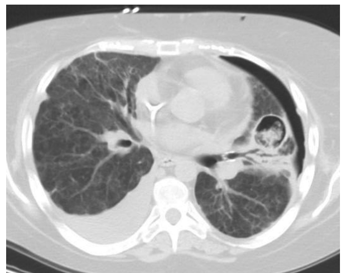
Fig. 3. A single axial image from a Thoracic Computed Tomography (CT) scan acquired on Day 110 in a leukaemic patient with Invasive Pulmonary Aspergillosis (IPA). A 4 mm endobronchial valve (Zephyr ® , Pulmonx Inc. Neuchatel, Switzerland) is demonstrated within the lingular segmental bronchus proximal to an alveolar-pleural fistula caused by rupture of a fungal mass lesion. There has been a significant improvement in the previously demonstrated left-sided pneumothorax.

Persistent air leak (PAL) can be devastating in patients with significant underlying lung disease or other co-morbidities, especially in mechanically-ventilated individuals. In bone marrow transplant recipients particularly, air leaks are an ominous development, with a mortality rate of 75% reported in a previous series, in which death was commonly associated with IPA [1]. In this context, direct air leak attenuation is extremely challenging due to the typically poor physical condition of the patients affected and the high risks associated with surgical management. Non-surgical options include a Medical Pleurodesis, either by talc slurry or autologous blood patch pleurodesis (ABPP). Neither was attempted in this case given the marked failure of lung re-expansion. Talc instillation may also result in severe pain in patients with benign pleural disease and an irrevocable empyema in patients with concomitant lung or pleural infection. ABPP is a painless procedure,