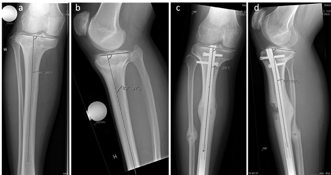
Figure 3. 30-year-old man with 35 mm of tibial shortening due to traumatic injury to the proximal tibial growth plate in childhood. Furthermore, the patient had a symptomatic high-riding fibular head (a). Initial PPTA was slightly below normal (b). The patient was lengthened with a tibia Precice® nail. The fibula was osteomized, but transfixation was done only between the tibia and fibula distally to the osteotomy. This resulted in some lengthening of the fibula as well as an intended distalization of the fibular head (c). However, PPTA increased slightly from preoperatively, which was not intended (d). Delayed healing of the regenerate anteriorly (d). However, there was solid callus on 3 cortices (c, d).