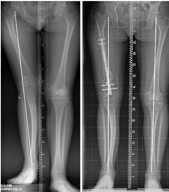
Figure 1. 20-year-old woman with CFD and fibular hemimelia. Initial shortening and valgus in the femur and valgus in the tibia. Femoral valgus and shortening were corrected with the retrograde nail technique; some remaining knee valgus due to deformity in the tibia. However, acceptable mechanical axis and currently no further surgery required. High-riding trochanter, but no Trendelenburg gait.