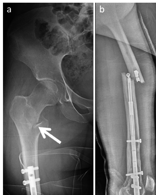
Figure 5. A 24-year-old woman who was lengthened 30 mm for idiopathic LLD with a retrograde lengthening nail. After consolidation of the regenerate she fell from a bicycle, sustaining a pertrochanteric femoral fracture (a). A 16-year-old girl with CFD, who underwent 40 mm of lengthening and correction of a valgus deformity with a retrograde lengthening nail. After consolidation of the regenerate she fell 2 m in a waterfall, sustaining a femoral fracture and breakage of the nail at the level of a locking bolt (b).