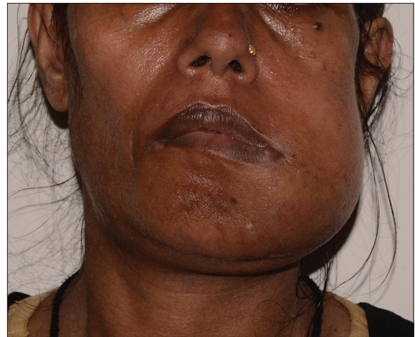
Figure 1: Extent of extraoral swelling

To identify the subtype of NHL, immunohistochemistry was performed using CD45, CD20, and CD3 markers.