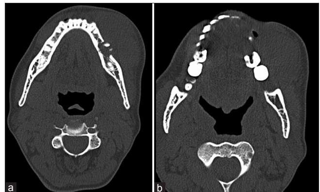
Figure 3: (a) Axial slice showing heterogeneous enhancing mass in the left buccal and Submandibular region. (b) Axial slice showing heterogeneous enhancing mass in the left buccal and submandibular region

The patient upon definitive diagnosis of NHL was started on palliative chemotherapy. Although partial regression of primary tumor was present, unfortunately the patient was lost to follow-up following 6 months after chemotherapy after being discharged from our unit.