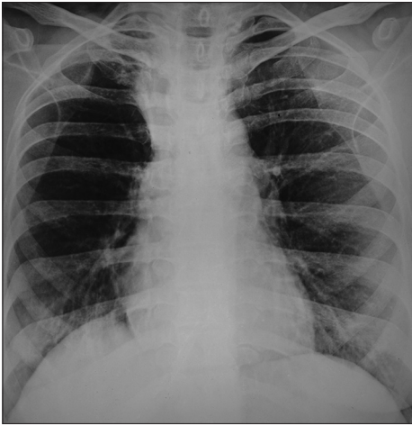
Figure 4: Chest X-ray (posteroanterior view) demonstrating multiple radiopaque foci bilaterally