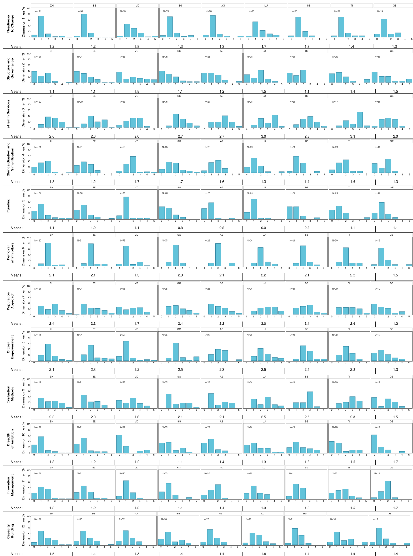
Figure 2 Histograms presenting, by dimension, the distribution of ratings of the nine cantons with the highest number of respondents. AG, Argovie; BE, Bern; BS, Basel; GE, Geneva; LU, Lucern; SG, St-Gall; TI, Ticino; VD, Vaud; ZH, Zurich.