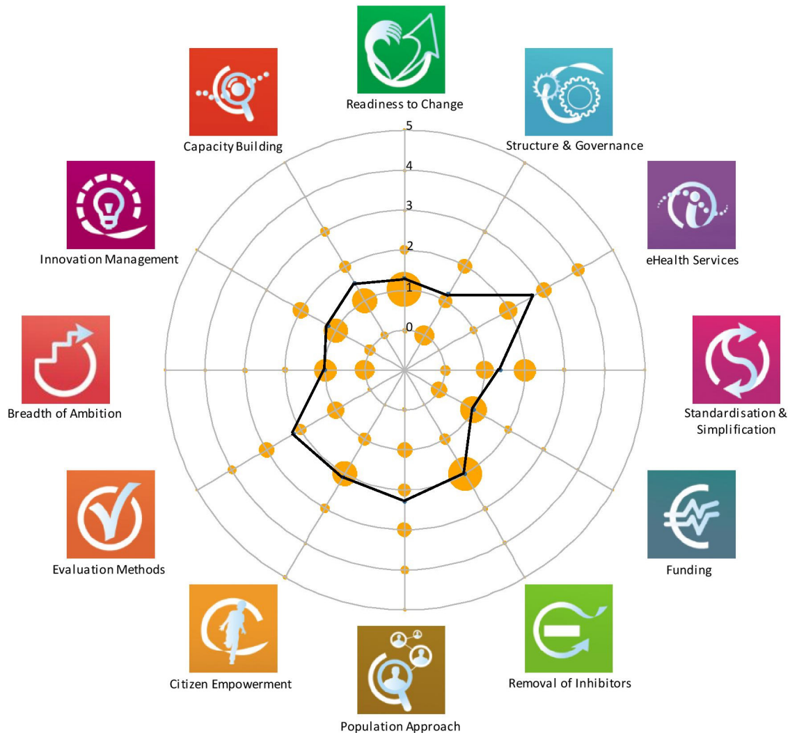
Figure 1 Spider graph representing means (dark line) and proportions (dots) of each response category, by dimension (dots are proportionate to the number of responses for each response category).

Management'; 'Capacity Building') and dimensions' means varying between a minimum of 1.0 (two dimensions: 'Funding'; 'Breadth of Ambition') and a maximum of 2.7 (one dimension: 'eHealth Services') (see figure 1 and table 2 for details). As illustrated in figure 1 and table 3 , which show the distributions of the individual responses, the span of responses varied across dimensions. Whereas dimensions 6 ('Removal of Inhibitors') and 10 ('Breadth of Ambition') concentrated the majority of responses on two response modalities, all the other dimensions showed a spread of responses over three or four response modalities.