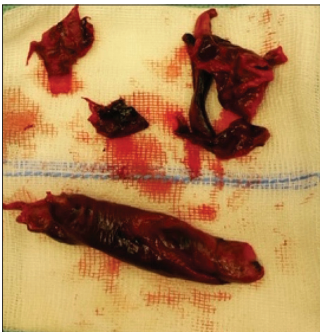
Figure 1: Clots removed from the pulmonary artery

the cannulation of the right atrium and the ascending aorta. The embolectomy was performed through a longitudinal pulmonary arteriotomy extending into the left pulmonary artery [Figure 2]. During the cardiopulmonary bypass, the surgeon performed a bimanual uterine compression to prevent uterine atony. The uterine contraction was achieved by administering an intravenous bolus of 100 micrograms of carbetocin (1-desamino-1-mono carba-2-(0-methyl)-tyrosine oxytocin), followed by sulprostone (analog of prostaglandin E2) intravenous infusion at a rate of 250 micrograms/h. The patient was successfully weaned from the cardiopulmonary bypass with dobutamine at a dose of 4 micrograms/kg/min and enoximone at a dose of 5 micrograms/kg/min, started for the persistent right ventricular dysfunction. She was extubated 8 h later. On day 2, we performed a CT scan of the lower body revealing left iliac deep venous thrombosis; inotropes were stopped and she was discharged from the intensive care unit. On day 5, intravenous unfractionated heparin was shifted to enoxaparin 6,000 ui international unit twice a day. The transthoracic echocardiography, performed during the postoperative course, revealed a complete recovery of the right ventricle function (Tricuspid annular plane excursion TAPSE 20 mm, TDI 11 cm/s). After 13 days, she was discharged.