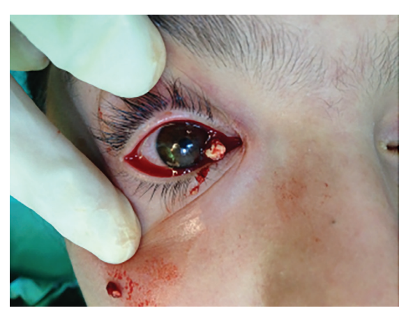
Figure 2. Intraoperative photograph of the patient