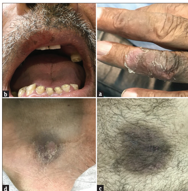
Figure 4: The recovery of patient's skin and oral lesions within next weeks following withdrawal of the causative medication. Note hyperpigmentation of recovered lesions characteristic of fixed drug eruption. (a) patient's finger lesion, (b) upper lip lesion, (c) malleolar skin, (d) abdominal skin

Al Aboud et al. reported FDE in daughter and father following ibuprofen ingestion. [14] This familial occurrence can indicate a genetic predisposition for FDE due to ibuprofen. Alvarez Santullano et al. described FDE lesions affecting skin, tongue, and oral mucosa in an elderly