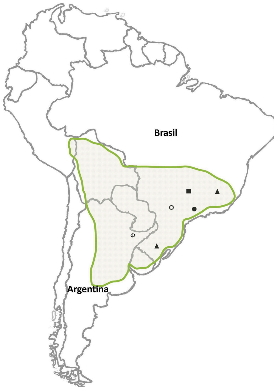
Fig. 1. C. d. terrificus distribution in South America (green area), reptile area follows the electronic database accessible at http://www.reptile-database.org accessed on 14 May 2020. Symbols indicate the approximate regions of origin of the snakes sampled in previous and present work: ■-Wiesel et al. (2018), ●- Melani et al. (2015), ▲- Boldrini-França et al. (2010), ○ – Georgieva et al. (2010), Φ Present work.

Five mg of C. d. terrificus venom were dissolved in 200 mL of solvent A