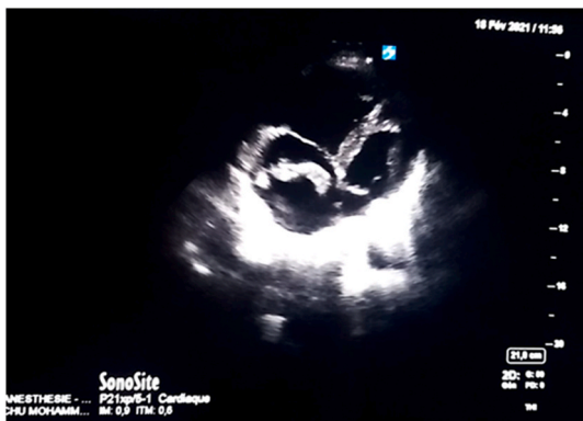
Fig. 4. Intra right cavity thrombus about 62 mm in length of patient infected with SARS COV2.