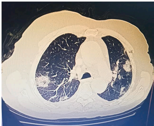
Fig. 1. CT scan of patient infected with SARS COV2.

Hemodynamic variables was assessed by Vigelio system that showed a low cardiac index (1.9 l/min.m 2 ), abnormal stroke volume variation (14%) and high systemic vascular resistance (2300 dyne-sec.m 2 /cm 5 ). It was decided to perform a doppler echocardiography based on positive homans sign. The results showed à Deep vein thrombosis in the middle part of the superficial right femoral vein arriving at the right popliteus vein with an occlusion of the left superficial and deep femoral artery. The patient was admitted to the operating room, under spinal anesthesia, with Fogarty embolectomy of the femoral artery. Fresh thrombotic material was removed, which was sent for histological assessment.