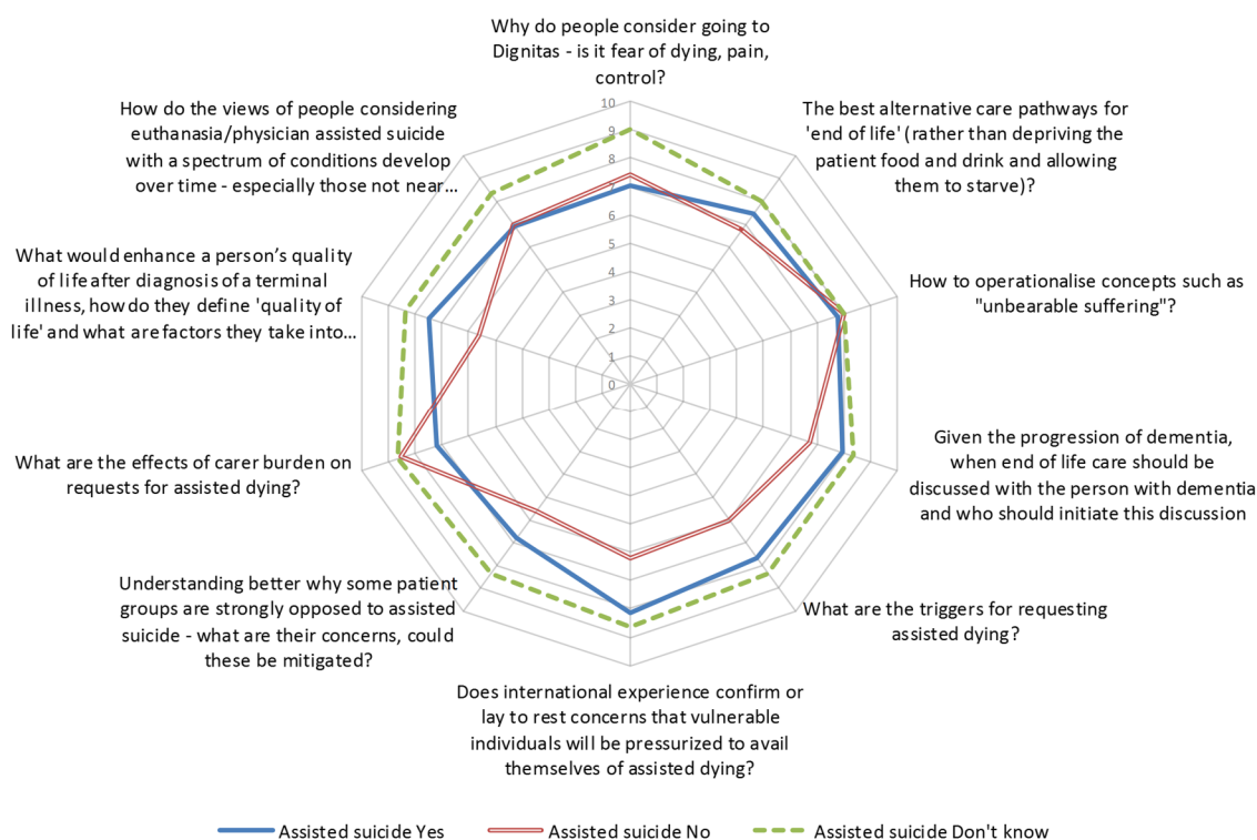
Figure 2 Relationship between respondent views on assisted suicide and mean rating for highest consensus questions.

The pattern of ratings was not consistent for all views on assisted dying (assisted suicide, doctor-assisted voluntary euthanasia, family-assisted euthanasia), though mean ratings tended to be slightly lower among respondents who were against any hypothetical changes in the law (figures 2–4).