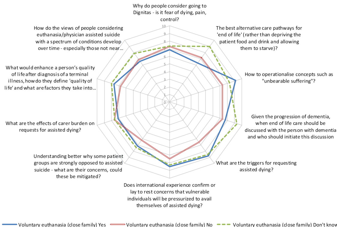
Figure 4 Relationship between respondent views on family-assisted voluntary euthanasia and mean rating for highest consensus questions.

applied here (at least half the respondents giving \geq 7 points) was able to identify the highest priority questions.