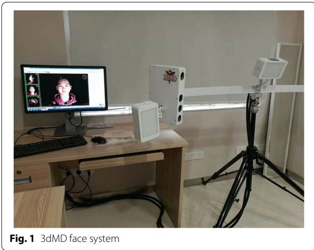
Fig. 1 3dMD face system

data were stored in OBJ format files and imported into 3dMDvultus analysis software for further analysis.