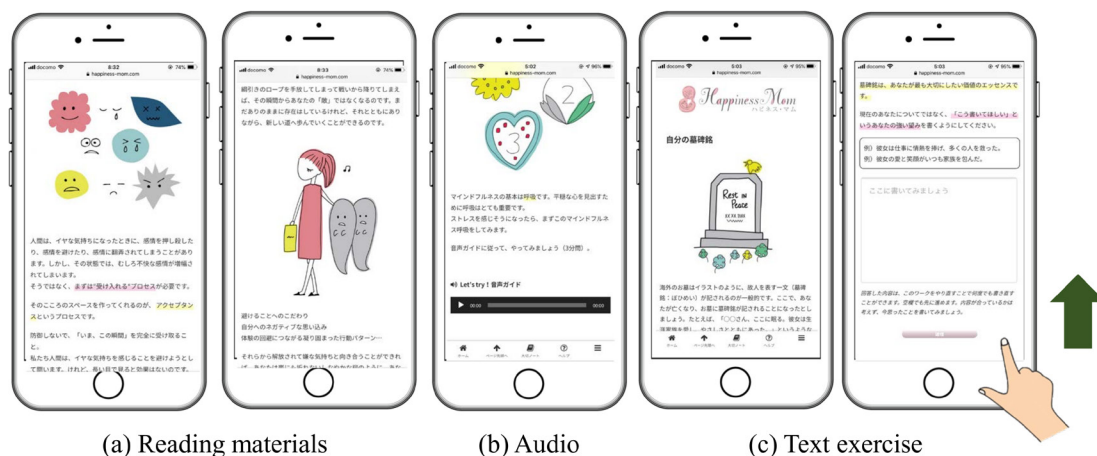
Figure 2 Screenshots of Happiness Mom.