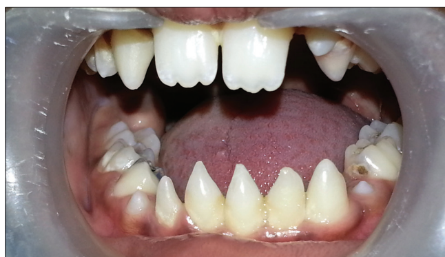
Figure 2: Peg-shaped mandibular incisors