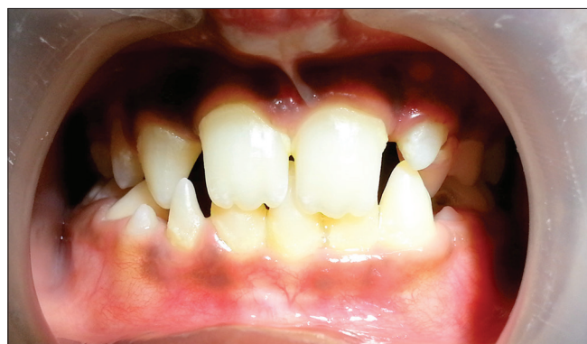
Figure 1: Peg-shaped maxillary incisors