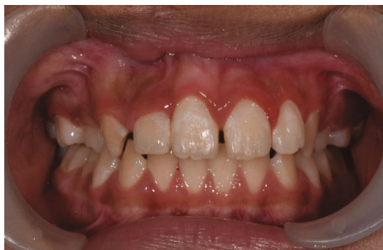
FIGURE 8: Six months posttreatment photograph: patient's upper incisors in an acceptable arch alignment.

Malposition teeth if left untreated lead to complications in the developing dentition with may be detrimental to either to the dental functions or the dental aesthetics [10]. Common problems encountered are issues related to loss of space due to migration of adjacent teeth into the available space [11]; traumatic bite on opposing teeth that lead to gum recession and mobility of teeth [12]; and attrition of enamel surface of the opposing teeth in contact [7]. Complications such deviation of the jaw and temporomandibular joint problems are common if premature contact on occluding teeth found [13]. Other issues include difficulty