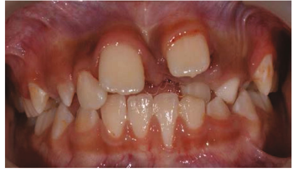
FIGURE 1: Pretreatment photograph showing wide diastema median, anteriorly positioned tooth 21, palatally malposition tooth 22, and gingiva recession of tooth 31 due to traumatic occlusion from the extracted supernumerary tooth.

2.2. Case 2. A 9-year-old boy was referred from a private dental clinic for management of palatally placed tooth 12. On examination, tooth 12 was found to be palatal to tooth 11, rotated, and in a crossbite to the lower incisors (Figure 5). We placed orthodontic brackets (022 \times 028 slots, American