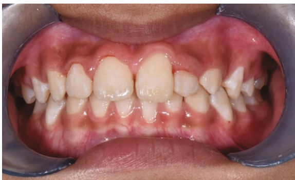
FIGURE 4: Tooth 21 and tooth 22 brought into acceptable arch alignment and the severity of gingiva recession of tooth 31 reducing.