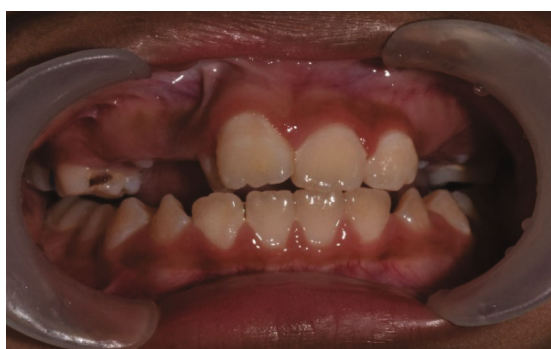
FIGURE 5: Malposition and rotate tooth 12 palatal to tooth 11.