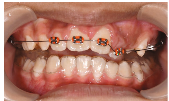
FIGURE 3: A 2 \times 4 orthodontic appliance to guide malpositioned tooth 22 into arch alignment.

Orthodontics) on the four maxillary permanent incisors and molar bands around the maxillary permanent first molars for a 2 \times 4 orthodontic appliance to align tooth 12. However, it was not possible to place a stable 012 round NiTi orthodontic wire through the bands and brackets due to a long span flexible archwire. This is mainly because of the absence of the right maxillary permanent premolars and primary molars.