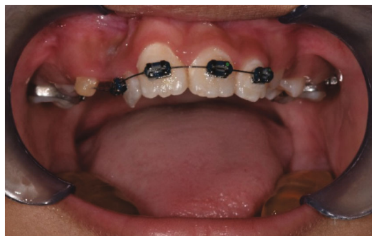
FIGURE 6: Sectional orthodontic wire appliance used to rotate and bring tooth 22 anteriorly into arch alignment.