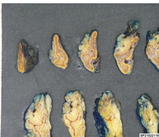
Figure 2. Cut sections of the left adrenal specimen.

The patient underwent elective laparoscopic transabdominal left adrenalectomy. There were no intraoperative or postoperative complications, and she was discharged the day after surgery. On subsequent phone follow-up 4 weeks post-operation, the patient was well and reported return to normal function.