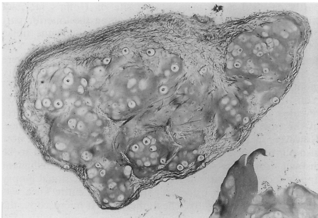
Figure 2 Loose cartilage body with focal fibrosis (case 3) (Van Gieson \times 67 ).