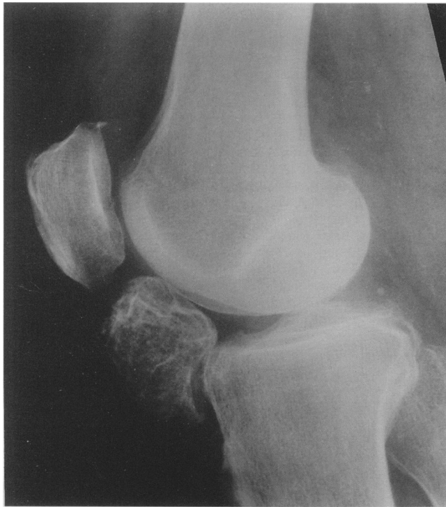
Figure 1 Plain radiograph of synovial chondroma in the knee (case 4).

Synovial chondromatosis is a rare benign condition characterised by cartilage formation within the synovium. It is usually a monoarticular disorder with the knee, hip, ankle and elbow as the main sites of involvement, and men are affected more often than women (Schajowicz, 1981). The characteristic roentgenological appearance of synovial chondromatosis is multiple synovial cartilage nodules varying from a few millimeters to 1 cm in diameter, but it may also present as a large solitary chondroma, originating from the coalescence of smaller chondromas or from growth of a single nodule (Edeiken et al. , 1994). The histological