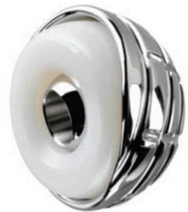
Figure 2. The Avantage® dual mobility cup. The metal head ranges from 22 mm to 28 mm in diameter depending on the cup size and it is pressed into the polyethylene liner with a special instrument. The liner articulates with the cylindro-spherical metal cup. This figure is the property of Biomet Inc of its affiliates, which have granted their permission for usage only on this publication and solely for educational and scientific purposes.

The success of hip arthroplasty depends in part on the biomaterials used in bearing surfaces. The traditional hard-on-hard and hard-on-soft articulations such as ceramic on ceramic and metal on polyethylene respectively proved to be durable with low rate of wear. The introduction of DMCs, where the bearing surfaces included soft-on-hard articulation, created some concerns. Adam et al. , for instance, demonstrated a volumetric polyethylene wear of 54.3 mm 3 annually in uncemented DMCs, which is comparable to conventional metal-on-polyethylene bearings with 22 mm heads. 17 Furthermore, reports of long-term survival of these cups are sparse and mainly come from centers of origin in France. 18 The first genera-