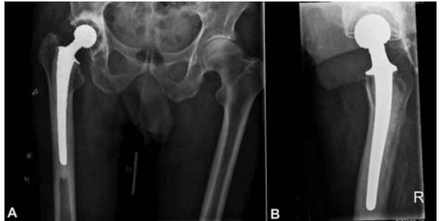
Figure 1. A) and B) the cup of this total hip prosthesis was revised to dual mobility cup due to recurrent dislocation. The antero-posterior view shows a decreased global offset of the operated side compared to the contra-lateral side while the lateral view shows inadequate anteversion of the cup. These two factors contribute to instability, especially in patients with good range of motion in the operated hip.

ating scale was 2.5 (SD=1.1). The mean EQ-5D index was 0.76 (SD=0.12, median=0.81) while the mean quality of life on a visual analogue scale was 70 (SD=21, median=76.5).