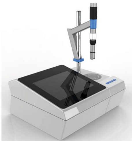
FIGURE 2: The appearance of the prototype.

(6000 rpm for 10 min) at room temperature. The supernatant liquid was then discarded, and the remaining sediment was quantified by weight for construction of microbial spherical particles. Polyvinyl alcohol, sodium alginate, and xanthan gum in a mass ratio of 1:1:2 (PVA mass is 2 g) were dissolved in 30 mL of deionized water and then cooled to 40°C, then mixed thoroughly with 1 gram microbial consortium (the concentration of cell is about 3.0 \times 10^9 cells g^{-1} ).