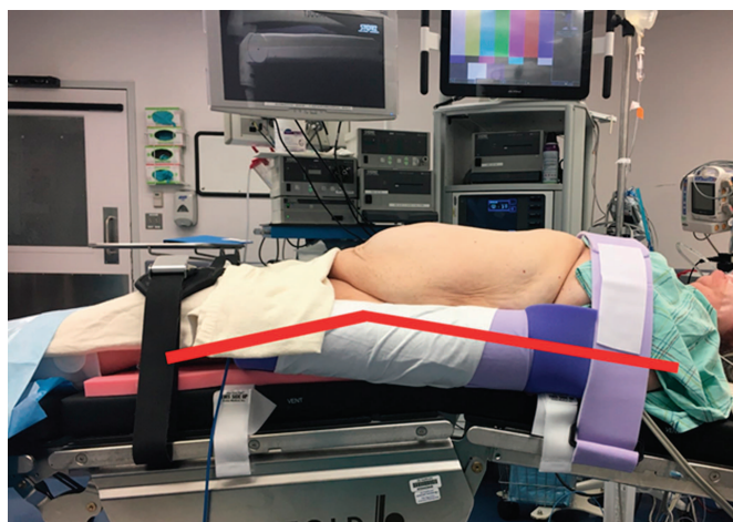
Figure 3. This is a typical position of a patient undergoing r-AWR, with the bed arms tucked and flexed to create the lumbar extension. Lumbar extension is often used to provide proper spacing between trocars to avoid internal and external collisions of the robotic arms during surgery.

will need to be performed to determine the efficacy of IONM in preventing postoperative nerve injury during robotic abdominal reconstruction. No untoward events occurred as a result of IONM in this study. Complications of hematoma, skin laceration, infection, or allergic reaction associated with SSEP IONM are rare.