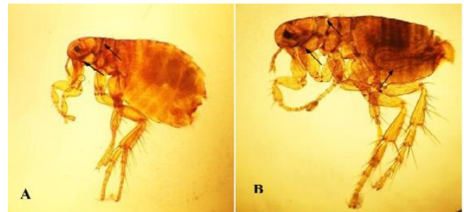
Fig. 2. A) Female hedgehog flea; A. erinacei , genal and pronotal ctenidia (Arrow). B) Male A. erinacei , genal and pronotal ctenidia and aedeagus organ (Arrow), (40×).