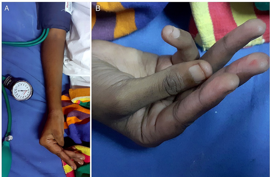
FIGURE 3: Positive Trousseau's sign indicative of hypocalcemia

Blood investigations showed moderate anemia (hemoglobin: 6 g/dl) of normocytic normochromic type, hyponatremia (106 mg/dl), hypokalemia (2.7 mg/dl), hypochloremia (93 mg/dl), hypocalcemia (8.3 mg/dl), hypomagnesemia (1.5 mg/dl), and hypophosphatemia (2.9 mg/dl). Arterial blood gas analysis was normal. There was no significant loss of electrolytes in urine. She had low vitamin D levels (15 ng/ml) with normal parathyroid hormone (PTH) levels. Her thyroid function and creatine phosphokinase were within normal limits. Electrocardiogram (ECG) showed a prolonged QT interval (corrected QT interval of 536 msec) and U waves (Figure 4); an echocardiogram done was normal. Urea and creatinine were indicative of a pre-renal acute kidney injury (AKI). Electromyography could not be done as the patient and her husband did not consent for the same.