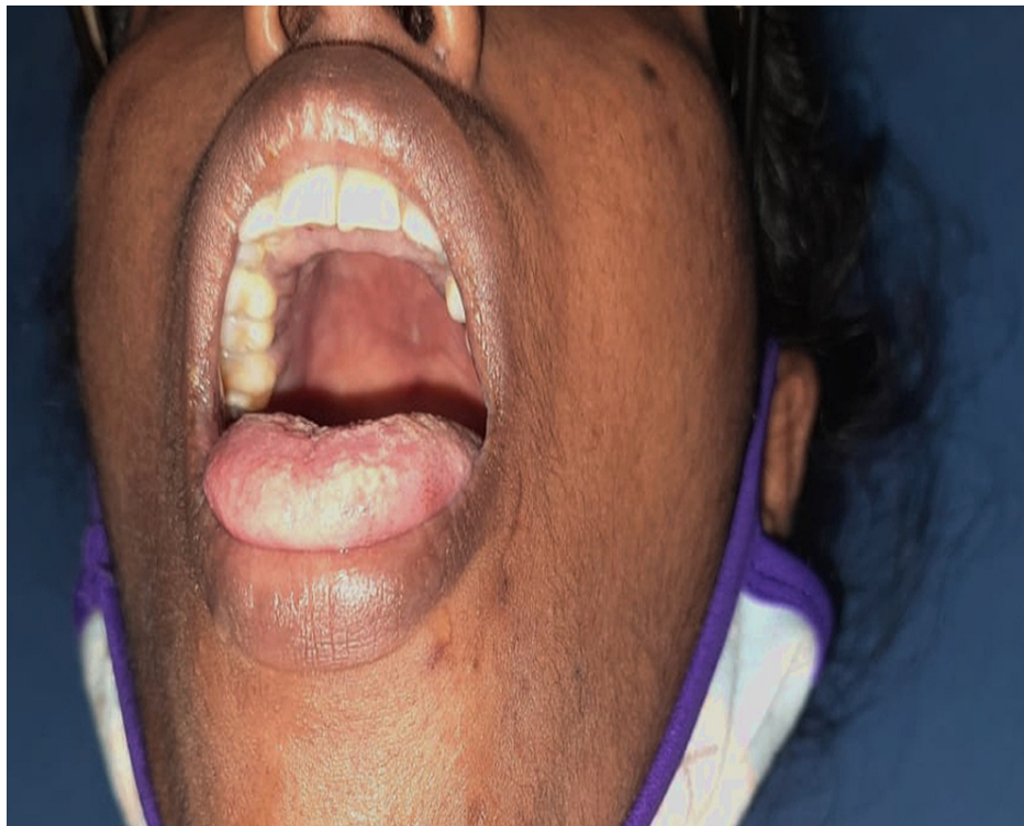
FIGURE 2: High-arched palate