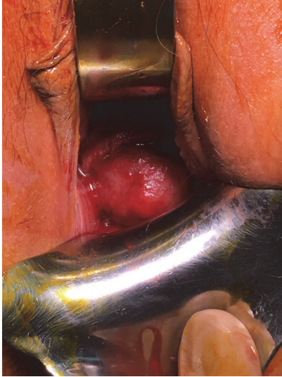
FIGURE 1: Obstructive cervical fibroid prolapsing through into vagina.