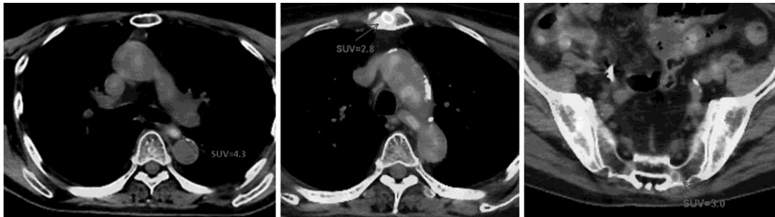
Fig. 2. On FDG-PET/CT for metastasis surveillance, focally increased uptake of FDG was noted in the intrathoracic esophagus (SUV 4.3), sternum (SUV 2.3) and sacrum (SUV 3.0).