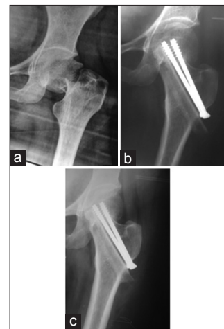
Figure 1: 28-year-old female with trauma. (a) 7-week-old displaced fracture of femur, neck (b) 7-month post-operative X-ray, (c) 22-month post-operative X-ray

to metabolic (osteomalacia) disorder. According to Sandhu classification, 7 patients were Type I, 6 patients were Type II, and 2 patients were Type III. Mean period of delay from injury to presentation at our institute was 3.07 months (ranging from 1 to 6 months). Mean follow-up was 18.5 months (ranging from 10 to 49 months). Union was achieved in 13 cases during 3-5 months (average 3.7 months). 2 patients developed nonunion with progression of AVN (Sandhu Type III) which were later treated with bipolar hemiarthroplasty, both of these cases presented with history of trauma. None of our patients with healed fracture developed fracture of fibular graft and did not show signs of AVN in femoral head on X-rays till the past available follow-up. Functional status was evaluated at 6 months according to Harris hip score and was poor in 2 patients (Sandhu Type III), fair in 2 patients (Sandhu Type II), good in 6 patients (4 patients Sandhu Type II and 2 patients Sandhu Type I), and excellent in 5 patients (Sandhu Type I). X-rays of 3 patients are shown in Figures 1-3.