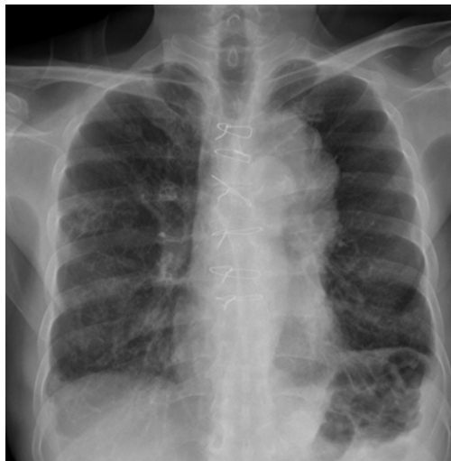
Figure 1 Chest radiograph.

A 63-year-old-male ex-smoker presented with a 2-week history of productive cough and shortness of breath. He had a history of coronary artery bypass grafting (CABG) surgery 20 years ago. He was diagnosed with ocular and bulbar myasthenia gravis 12 years ago with a positive anti-acetylcholine receptor antibody. He had no history of dyspnoea at rest, orthopnoea, paroxysmal nocturnal dyspnoea, cough, wheezing, or chest pain. He had three previous admissions for lower respiratory tract infections in the past 6 months. At two of the admissions, blood culture yielded Campylobacter jejuni and Streptococcus pneumoniae , respectively, which were treated accordingly. Sputum culture was negative. On clinical examination, he was conscious and orientated, temperature was 37.8°C, tachypnoeic (respiratory rate 25 breathes·min -1 ), tachycardic (heart rate 101 beats·min -1 ), blood pressure 120/70 mmHg and oxygen saturation 93% on room air. He had a normal jugular venous pressure and no pitting oedema around the ankles. Chest examination revealed reduced breath sounds and diffuse coarse crepitations in the middle and lower zones of the right lung. Blood tests showed: haemoglobin 12.4 g·dL -1 , white cell count 21.9 ×10 9 L -1 and platelets 660×10 9 L -1 . A chest radiograph was performed (figure 1).