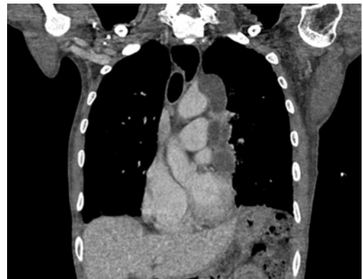
Figure 3 Computed tomography of the thorax mediastinal window (coronal view).

Describe the CT scan of the thorax (figure 3).