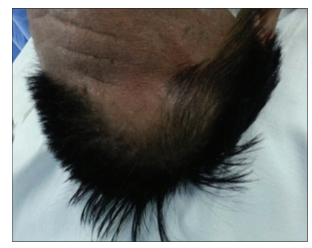
Figure 3: Bulging of ventriculosubgaleal pocket posteriorly, avoiding the region of the forehead for cosmesis

The subsequent outcome after each treatment modality within 6 months was observed and documented until the resolution of hydrocephalus or conversion to a permanent