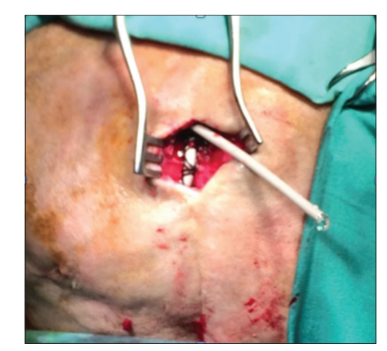
Figure 2: Secured the ventriculosugaleal shunt to the periosteum with suture