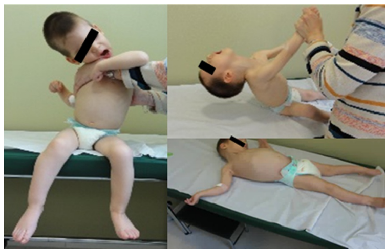
Figure 1 Clinical features. The child at 24 months of age showing global hypotonia, hypertonic posture of the limbs, incapacity to sit without support, and to hold the head upright.

After repeating some laboratory tests, alterations on thyroid function revealed elevated free T_3 level (4.84 nmol/L, normal values 0.63-3.90), low free T_4 level (8.2 pmol/L, normal values 9.1 - 25.0) and normal TSH level (3.54 mUI/L, normal values 0.3 - 4.5). Given this hormonal pattern, the existence of a deficit in T_3 carrier was considered as a potential diagnosis. To investigate this hypothesis direct sequencing of the SLC16A2 gene was performed, revealing 26 base duplication in exon 2. This gene mutation has not been described previously and causes a Val254Glu substitution followed by a frame