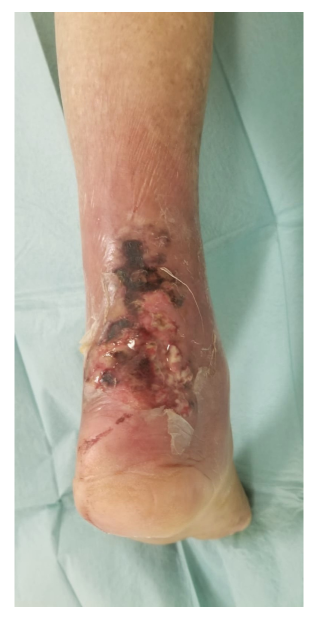
Fig. 1. Patient's left posterior lower leg wound initially.

Treatment options for PG include topical and intralesional therapy, systemic corticosteroid and biologic agents.<sup>4</sup> Systemic corticosteroid is considered to be the first-line treatment for most PG patients. Nevertheless, the PG wound healing process is long and less than half of the wounds healed after six-month immunosuppression treatment.<sup>5</sup> Surgical intervention following adequate immunosuppressive therapy may accelerate healing time but clinical evidence is limited which only focus on split thickness skin grafting with negative pressure wound therapy and the timing of surgery varies.<sup>6-8</sup> However, for the exposed Achilles tendon PG wound we described, prolonged tendon exposure would cause significant morbidity and skin graft is destined to fail to revascularize. Therefore, soon after