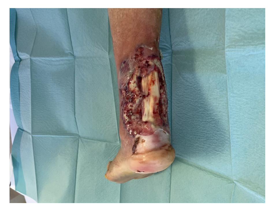
Fig. 2. The lower leg wound got worse rapidly with Achilles tendon exposure after incision drainage, debridement and antibiotics.