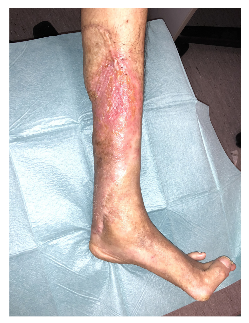
Fig. 3. Nine-month postoperative result.