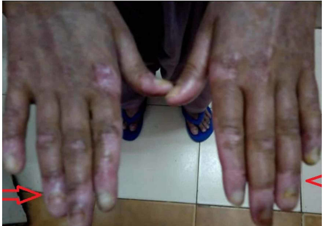
FIGURE 2: Loss of fingernails with peeling of skin

The initial differential diagnosis for the skin rashes and nail dystrophy included SLE, mixed connective tissue disorders, hypohidrotic ectodermal dysplasia, and dyskeratosis congenita. On investigation, a full blood count showed moderate hypochromic, microcytic anaemia with haemoglobin of 8 g/dL. Raised erythrocyte sedimentation rate (ESR) of 98 mm/1st hr and raised C-reactive protein of 7.9 (<5 mg/L) were suggestive of inflammation. Serology revealed positive antinuclear antibody (ANA) and positive anti-double-stranded DNA (anti-ds DNA), both suggestive of SLE. Direct Coombs test was also positive. Urine DR showed protein ++, red cell casts and granular casts, which along with an increased ratio of spot urinary protein to creatinine of 4.5, suggesting glomerular involvement. Serum C3 and C4 levels were low, measuring 31 mg/dL (88-252 mg/dL) and 8 mg/dL (12-72 mg/dL), respectively, supporting the diagnosis of SLE. Renal and liver function tests were normal except for low serum albumin. Computed tomography (CT) scan of the abdomen confirmed hepatomegaly with marked ascites. X-ray chest showed right-sided LP (Figure 3). CT chest revealed bilateral multifocal multi-segmental ground glass haze along with multiple enlarged cervical, pretracheal and carinal lymph nodes, and bilateral mild pleural effusion, extending in the oblique fissure suggestive of active pulmonary infection.