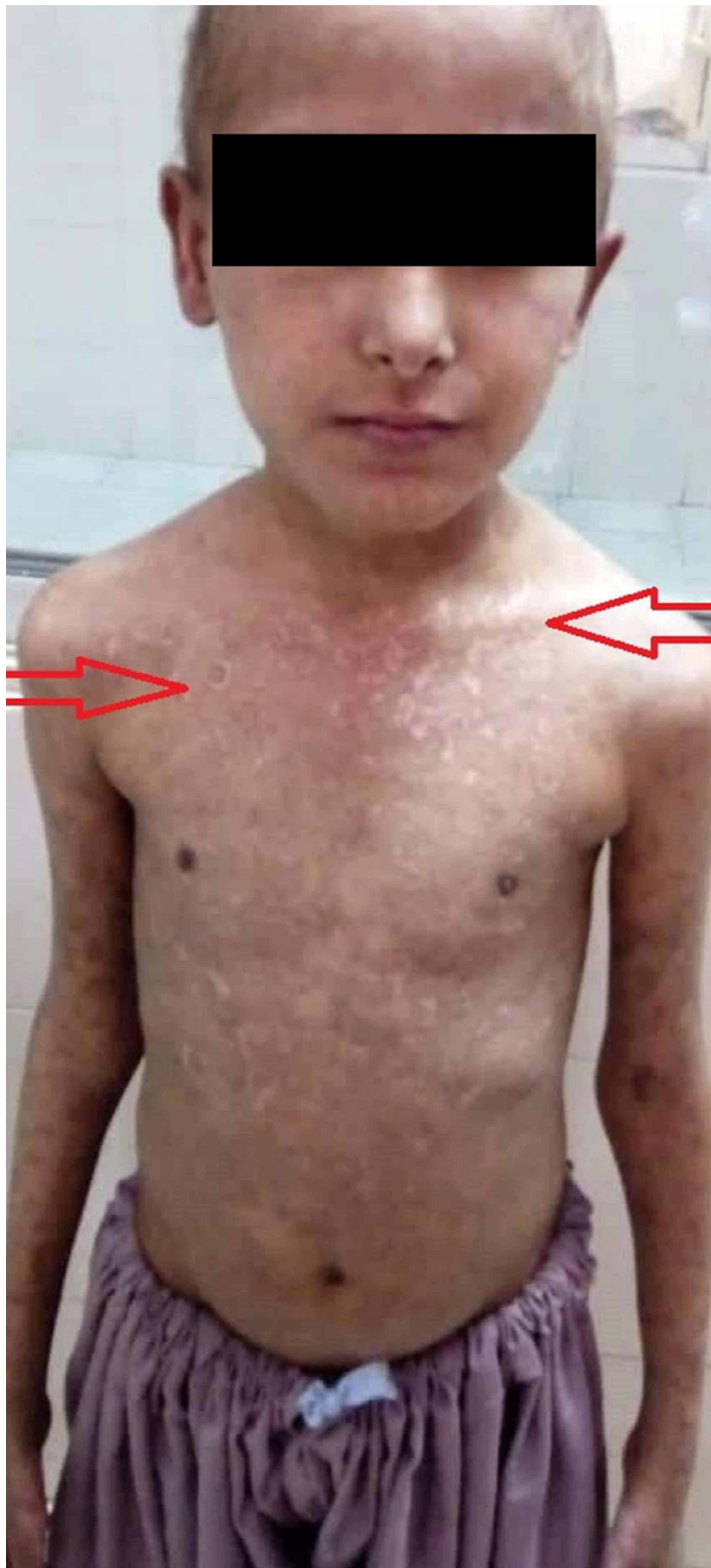
FIGURE 1: Scaly rash with occasional targetoid lesions all over