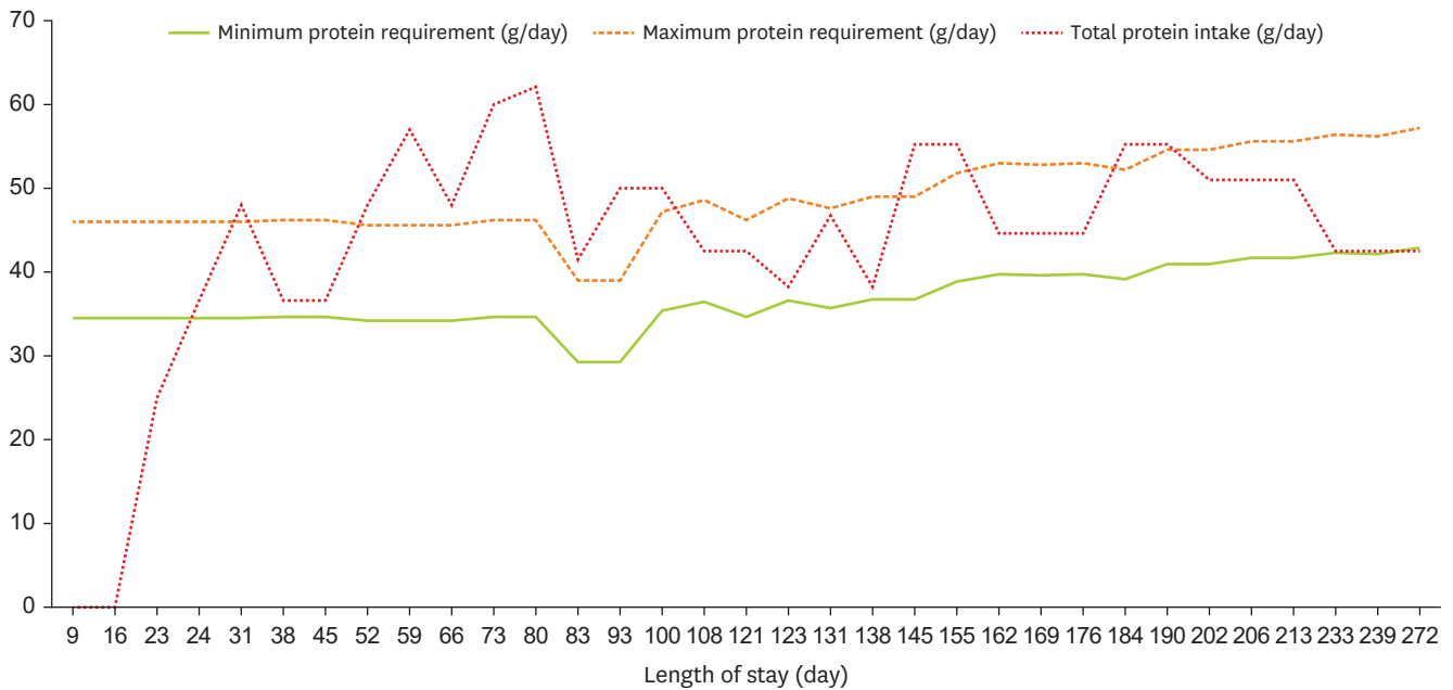
Figure 2. Total protein intake, minimum and maximum protein requirement. The minimum protein requirement was determined by multiplying the actual body weight by a factor of 1.5, while the maximum protein requirement was determined by multiplying the actual body weight by a factor of 2.0.

Nutritional support is critical for the optimal recovery of children with severe TBI. Proper nutrition aids in managing the complex physiological changes that occur post-injury and supports overall recovery [14]. Estimating energy requirements in pediatric patients typically involves using the Schofield equation or WHO equations to determine the BMR, which is then adjusted using activity and injury factors [12,13]. Protein requirements are generally set at 1.5 to 2.0 grams per kilogram of body weight [5]. In cases of severe TBI in children, higher protein intake may be necessary to support wound healing and recovery processes.