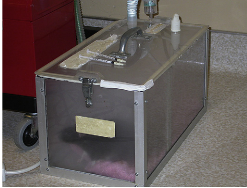
Fig. 1. Use of nebulization for treatment of rats with severe respiratory disease. Nebulizing formulas usually contain acetylcysteine, a bronchodilator, and an antibiotic with normal saline.