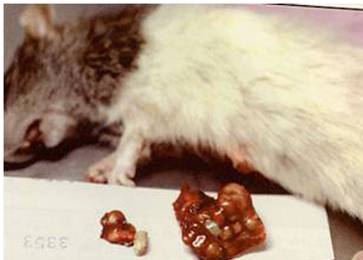
Fig. 3. Gross necropsy of rat lung with abscesses due to Corynebacterium kutscheri.

Diagnosis is by examination of impression smears from affected tissues or tissues sections. Definitive diagnosis requires characterization of the cultured bacteria or serology. Positive ELISA should always be confirmed by culture. The isolation rate of this organism is most successful from specimens collected from the oral cavity and submaxillary lymph nodes. This agent is difficult to recover from animals latently infected in enzootically affected colonies, although oral swabs of the gingiva may be helpful. PCR is not widely available.