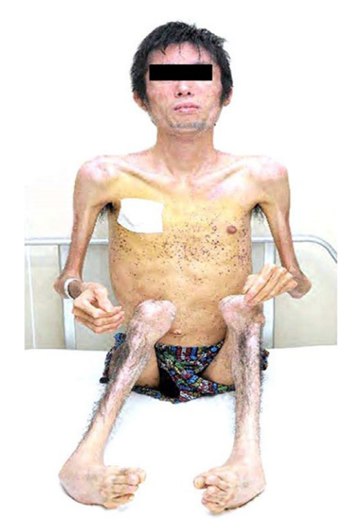
Figure 1 | Patient appearance.

of pioglitazone treatment (Table 1). As his liver transaminase levels were still abnormal, we therefore carried out a liver biopsy, and diagnosed the patient with type 4 non-alcoholic fatty liver disease<sup>2</sup> (Figure 2; Figure S3).