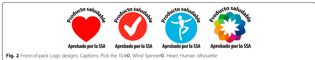
Fig. 2 Front-of-pack Logo designs. Captions: Pick the Tick®, Wind Spinner®, Heart, Human silhouette

The dynamics for each focus group initiated by asking the participants if they are usually responsible for making household food purchasing and feeding decisions. Afterwards, participants were asked about how they describe a healthy and unhealthy packaged food. Afterwards, a choice exercise was conducted with the participants showing the four boxes of each FOPL, in the following order: 1) Logos, 2) Stars Rating, 3) GDA's, and 4) MTL. The same presentation order was followed in all focus groups. For each FOPL, participants were asked to explore individually each of the four cereal boxes with different nutritional value. The participants were asked about their perceptions regarding subjective understanding and acceptability of the evaluated FOPL. As a final step, a set of four cereal boxes was displayed to the participants, one for each FOPL with the healthiest nutrition profile. In this step, participants were asked to compare each FOPL and choose the one they perceived had the ability to best communicate the product healthiness and to express the reasons of their choice. As complementary information, participants were encouraged to discuss additional issues regarding FOPL understanding and acceptability, to provide feedback for improving the evaluated FOPL, and expressing desirable characteristics of new FOPL.